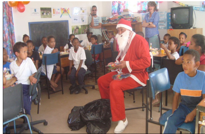
Figure 2 Father Christmas was on time