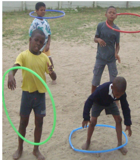
Figure 3 hoola hoop as a team sport