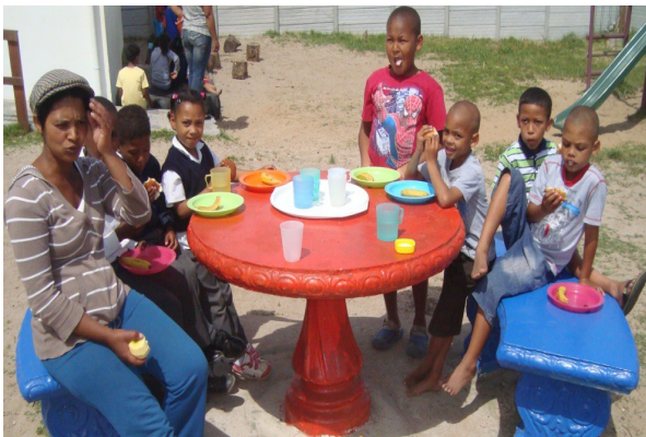
Figure 1 lunch time in the sun